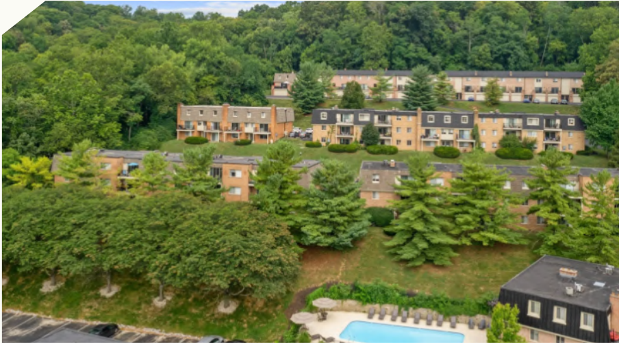
My 90-Unit Apartment Community in Mariemont Area in Cincinnati, Ohio