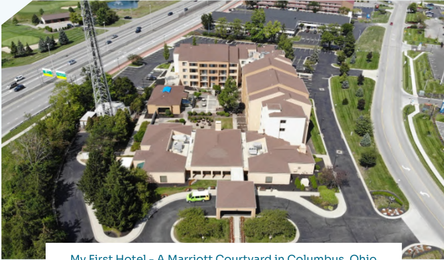
My First Hotel – A Marriott Courtyard in Columbus, Ohio

If I can do a deal like the hotel above, so can you. One of the things that people tell me as to why it's impossible for them to do BIG deals is "BANKS won't lend money to me to do a BIG deal unless I make millions in my job or I own a big business."